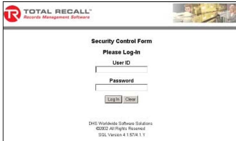
Fig. 1- 1

We will begin using the Web Module by logging in. Each web user should be given their own unique User Id and Password. Enter the User Id and Password in the spaces provided as shown in Fig. 1-1. Then either click on or use the <ENTER> Key to log on.