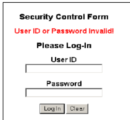
Fig. 1- 2

If an incorrect Login or Password is entered then the screen shown in Fig.1- 2 will open. If this occurs simply re-enter the correct Information.